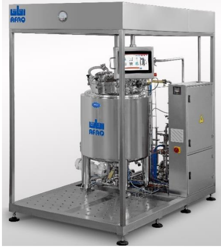
Figure 2 Aseptic preparation line

According to the previous data , AFAQ encourages its customers to enter the prefilled syringe market, and they will receive all assistance and support from AFAQ, considering that AFAQ portfolio is offering integrated production lines for aseptic products, which needs specific purity requirements that can only be achieved with great technical skills and experience.