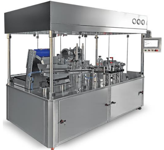
Figure 1 Prefilled syringes Filling machine

According to the previous data , AFAQ encourages its customers to enter the prefilled syringe market, and they will receive all assistance and support from AFAQ, considering that AFAQ portfolio is offering integrated production lines for aseptic products, which needs specific purity requirements that can only be achieved with great technical skills and experience.